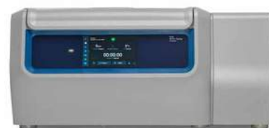
Thermo Scientific™ Sorvall™ X4R Pro/Multifuge™ X4R Pro General Purpose Centrifuge