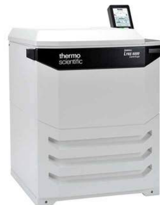
Sorvall LYNX 6000 Superspeed Centrifuge

The Sorvall LYNX 4000 and 6000 Superspeed Centrifuges, Sorvall BP 8 and 16 Blood Banking Centrifuges, Sorvall BIOS 16 Bioprocessing Centrifuge, Cryofuge 8 and 16 Large Capacity Blood Banking Centrifuges, and Thermo Scientific general purpose centrifuges represent a wide array of centrifuges and their innovative rotors. Covering a broad range of processing needs, these products support labware from microplates and microtubes to large-capacity bottles, and they are designed to deliver outstanding performance, spin after spin.