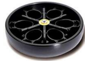
Thermo Scientific™ HAEMAFlex™ 6 windshielded swinging-bucket rotors, 6 x 550 mL