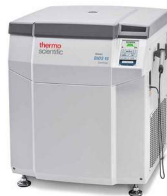
Sorvall BIOS 16 Bioprocessing Centrifuge