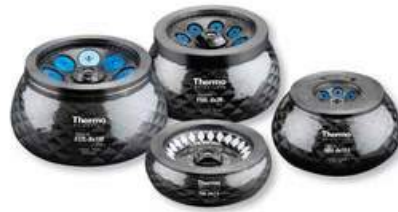
Fiberlite carbon fiber rotors

The Fiberlite carbon fiber rotors used in our centrifuge models improve energy efficiency compared to aluminum and other metal rotors. Fiberlite rotors weigh up to 60% less than aluminum rotors (Table 5). Less weight allows for faster acceleration and deceleration rates for shorter run times (Table 6). The decrease in time of use can result in less energy used per run.