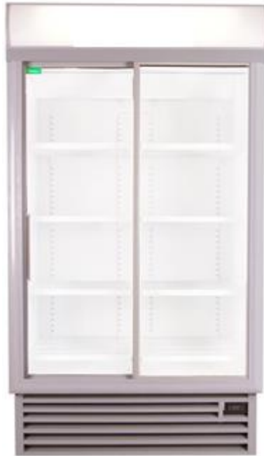
Part # SCICOOOL1140R

Thermo SCIENTIFIC Authorized Distributor